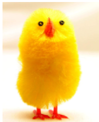
Figure 1: Aww....

\documentclass{article} \usepackage{graphicx} \begin{document} Figure \ref{fig:chick} shows \ldots \begin{figure} \centering \includegraphics[% width=0.5\textwidth]{big_chick} \caption{\label{fig:chick}Aww\ldots.} \end{figure} \end{document}